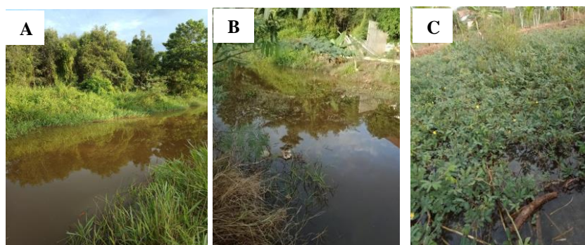
Figure 1 Observation points. A. Station I (water entry); B. Station II (mid-length); C. Station III (bridge as border).

Geographically, Palembang is located at 2°59'27.99S and 104°45'24.24E. Bukit Baru District is spread across 6000 Ha, with majority of them are functioned as settlements bordering Gandus District (south), Banyuasin Regency (west), Alang-alang Lebar District (north), and Demang Lebar Daun and Siring Agung District (east) (Ariansyah et al. , 2018).